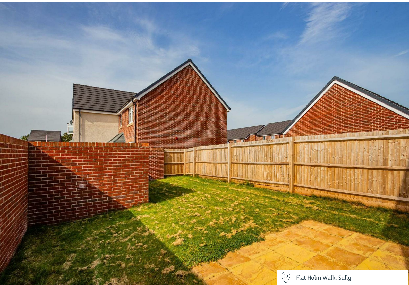
Flat Holm Walk, Sully